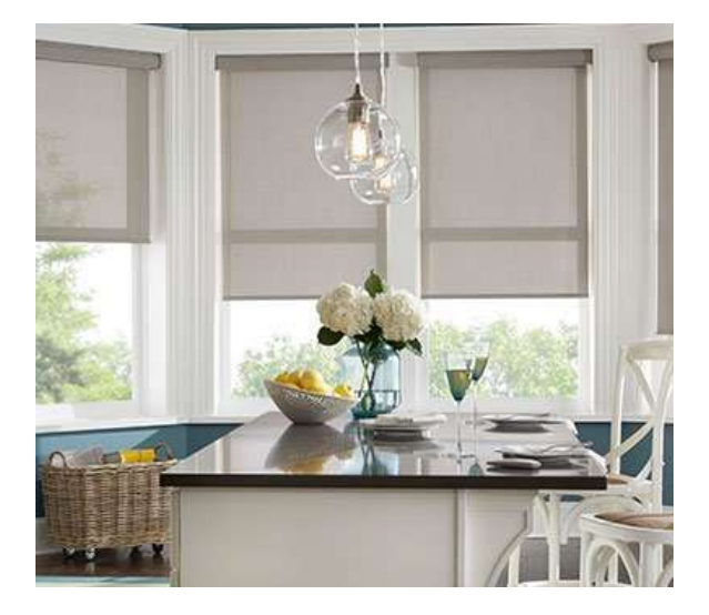
Complete the look of your shade with a Fabric Wrap Cassette or a Metal Fascia. Available in reverse roll for your preference.